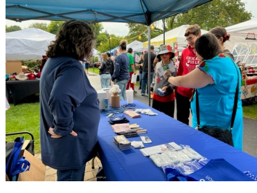
El Grito Festival Bolingbrook September 14

GLCU employees have been helping out our local communities. Here are a few of the places we'll be in September.