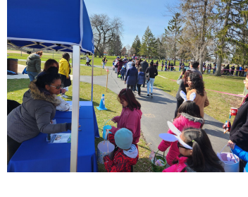
Fiesta Sin Frontera Waukegan September 21