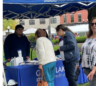
Mexican Independence Day Woodstock September 15